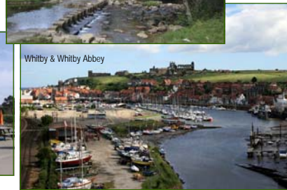
Whitby & Whitby Abbey