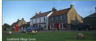
Goathland Village Green