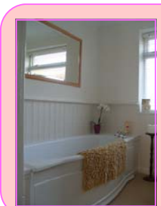
A spacious bathroom with double shower and bath, toilet and wash hand basin and equipped with fluffy towels, bubble bath and shower gel, helping you to wash your weariness away!