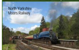
North Yorkshire Moors Railway