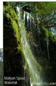
Mallyan Spout Waterfall