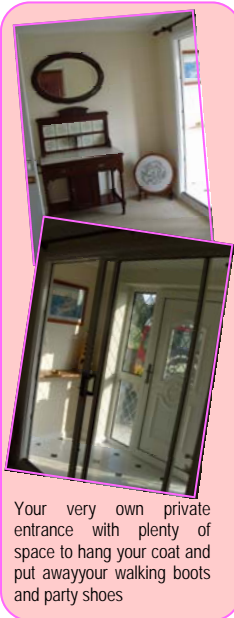
Your very own private entrance with plenty of space to hang your coat and put away your walking boots and party shoes