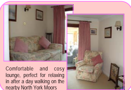
Comfortable and cosy lounge, perfect for relaxing in after a day walking on the nearby North York Moors